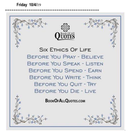
\underline{\text{Matthew 6:7*}} But when ye pray, use not vain repetitions, as the heathen do: for they think that they shall be heard for their much speaking.